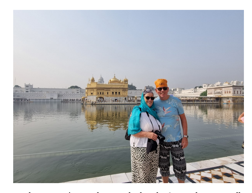
Not sure that orange is my colour or whether the £1 temple pants really go!