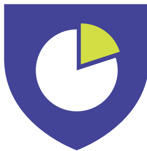
A percentage of your estate